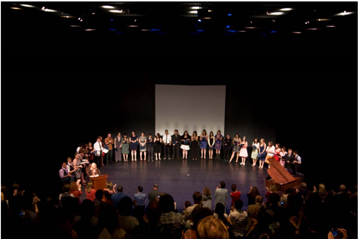
The Undergraduate Class of '09 at the Awards Ceremony, Friday, June 5 th , 2009.