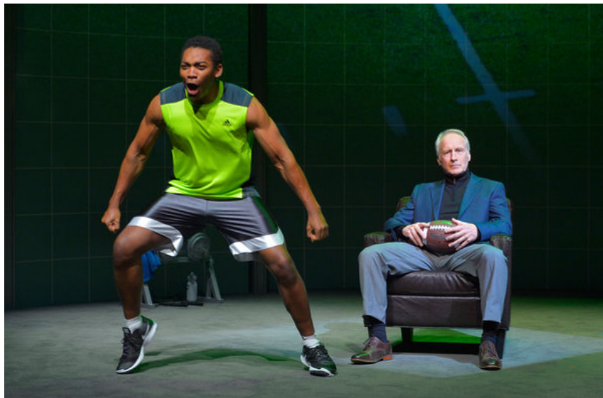
X's and O's (A Football Love Story) at Berkeley Rep