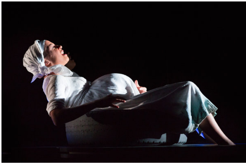
LITTLE CHILDREN DREAM OF GOD at the Roundabout Underground