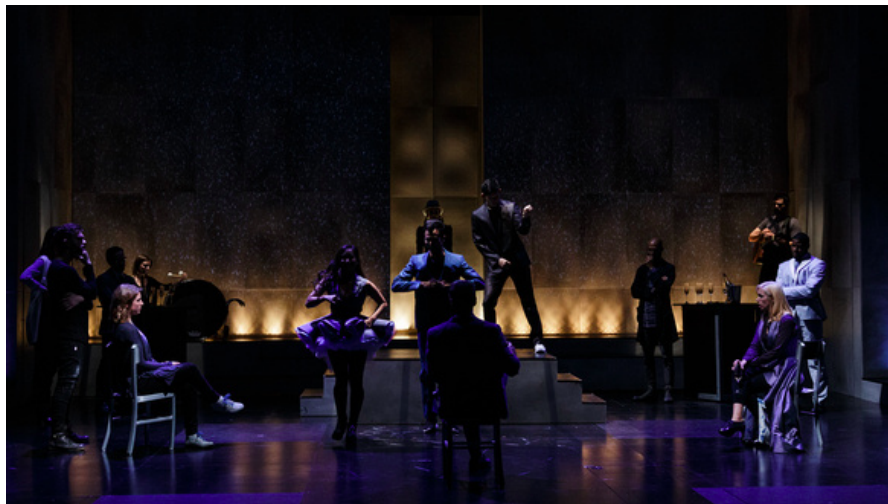
The Players and Ensemble