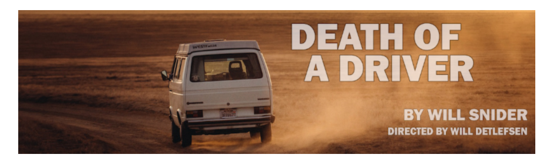
Opens Friday, April 17th at 7:30pm

When Quinn discovers her estranged mother is dying, she returns to a home she fled long ago. As she cares for her mother, Quinn wrestles with disturbing childhood memories. What is her mother's secret? What do the bedtime stories of Selkies her mother once told her really mean? Told in three interconnected monologues, Second Skin investigates the fraught relationship between mothers and daughters, and how one mistake can change a lifetime.