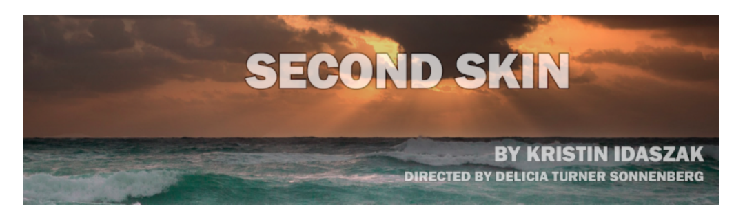
Opens Friday, April 17th at 7:30pm

Jonas is home alone. His drug addict father has disappeared. Hattie, a former professional wrestler who has fallen on hard times, shows up out of the blue. Stuck together in a home in the middle in the New Mexico desert, Jonas and Hattie wrestle with the truth of who they are and the lies they tell to get by. When the Exterminator arrives, Jonas and Hattie soon realize that the only allies they have may be each other. Widower explores what happens when villains turn into heroes, enemies turn into allies, and loss is transformed into something approximating redemption.