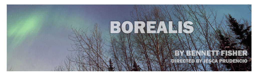
Opens Tuesday, April 14th at 7:30pm

The 2015 Wagner New Play Festival at UC San Diego features world premiere productions by our talented MFA playwrights, and directed, acted, stage-managed and designed by our nationally-acclaimed MFA companies. This year's plays travel as far as Kenya and the Arctic Wilderness, while featuring everything from pro wrestling to radical plastic surgery, from timeless ghost stories to a salient critique of corporate America. With their sharp eyes and unique visions, these writers tackle subjects as familiar and universal as the relationship between mothers and daughters and what happens when you outgrow the people who know you best.