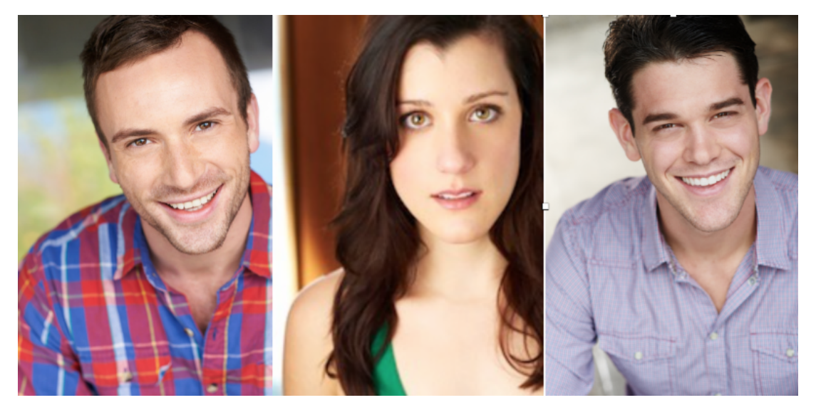
They recently did a small invited reading of it in New York for San Francisco-based company, PlayGround.