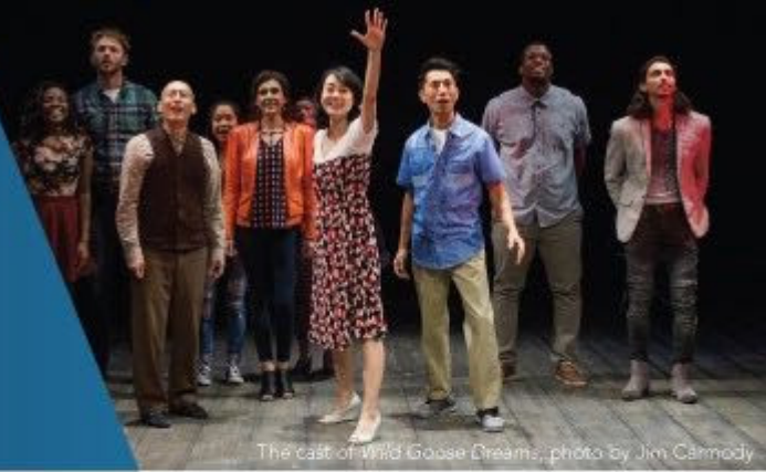
The cast of Wild Goose Dreams

Have you thought about a career in theatre ?